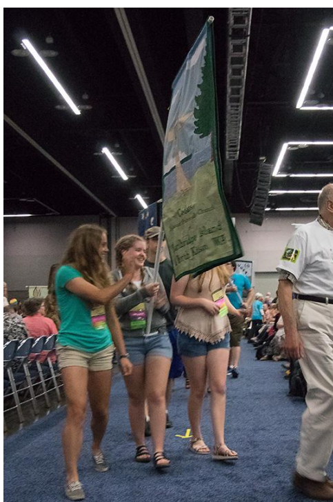
Cedars was well-represented at the 2015 General Assembly in Portland.