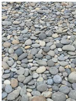
Opportunity Beach (awaiting the artist)