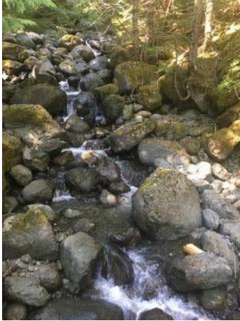
Olympic National Forest Scene