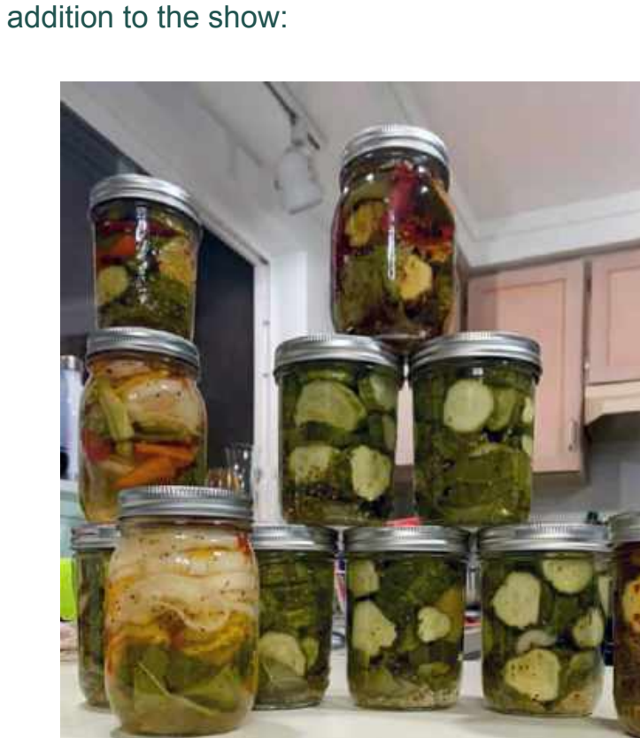
More Pickles from the Zackrie/Elliott Victory Garden

Facebook Page Administrators A recent addition to the show: